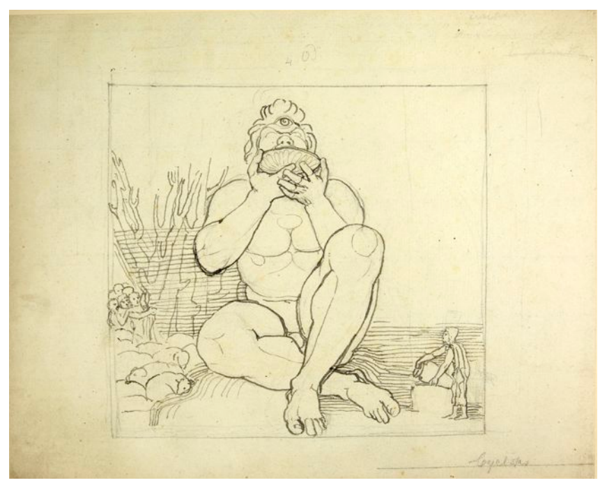
5. John Flaxman, Early study for Ulysses Giving Wine to Polyphemus, c. 1792–1805

Picasso created Arlequin ), Roger Fry considered the unavoidable selection and exclusion of content that occurs when "the infinite complexity and fullness of matter" is translated into "the bare geometric abstraction of mind" demanded by the act of drawing. <sup>16</sup> For Fry, drawings like Picasso's brought to the fore the motivating tension between what he described as the "structural" and "calligraphic" qualities of line—the way a linear rendering of a subject, in its inevitable and almost diagrammatic condensation of material reality, can be viewed as both representational and abstract. In Picasso's Arlequin and Calder's Bird , the various curves, spirals, and loops are able to refer to various identifiable aspects of their respective subjects (eyes, wings, batons, etc.) while retaining their identities as autonomous graphic gestures rendered from pencil and wire, respectively.