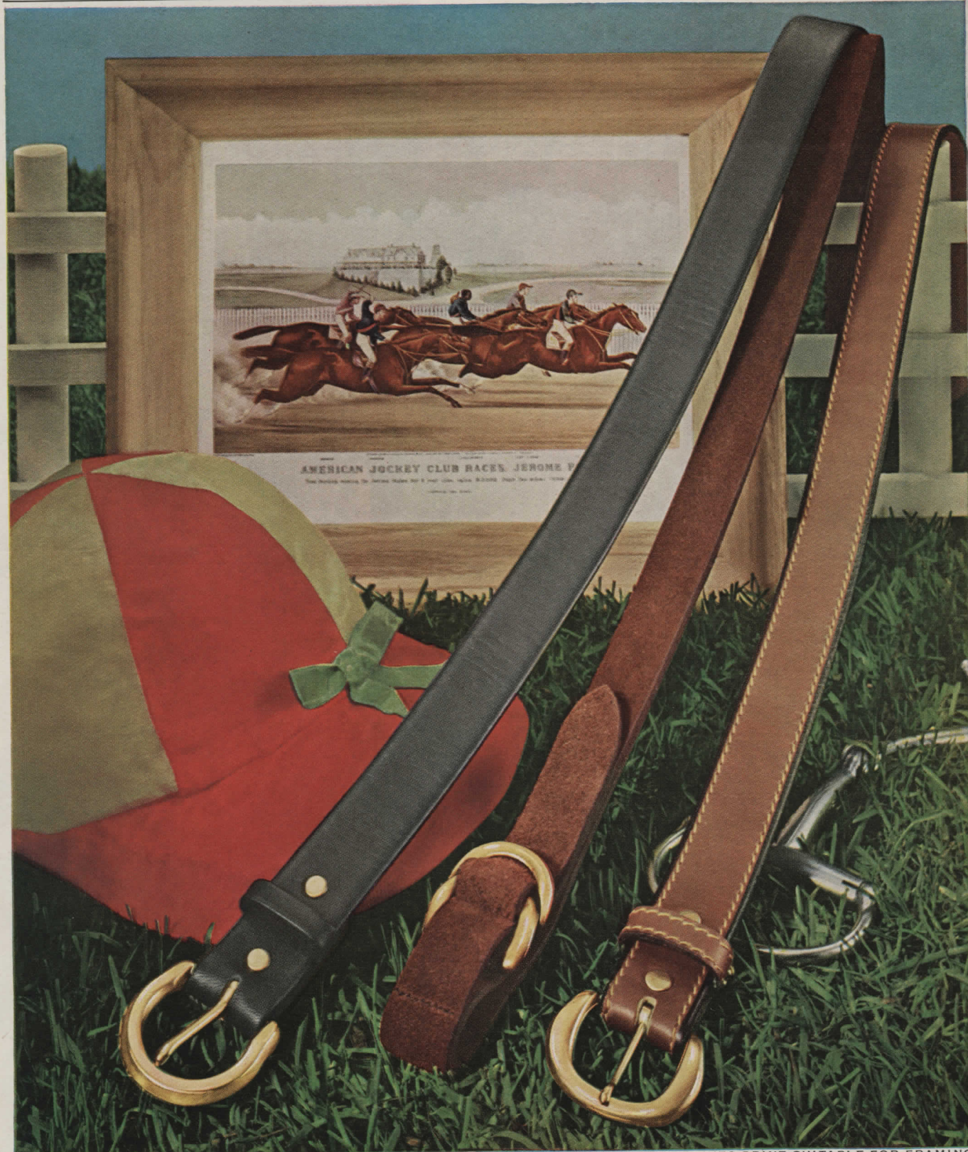
ANOTHER FINE PRODUCT OF KAYSER-ROTH

It may be that when the astronauts and cosmonauts, with their crude instruments, get far enough out into space to discover non-space, shove off for another solar system only to meet themselves coming back, they will find that Calder, with his peculiar cosmic, or Universal, or Einsteinian view, call it what you will, working quietly and alone in Saché and in Roxbury, Massachusetts, will already have anticipated them, and stated their experiences. #