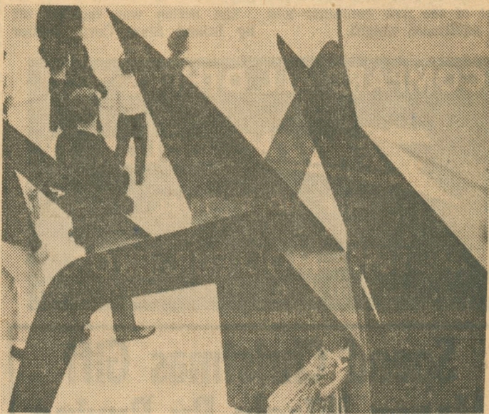
Peek-a-boo. Art sees you.

The works have been selected with care and thought — from Calder's early and delightful linear wire sculptures and drawings of circus people to his recent colorful mobiles and monumental static forms. The Alexander Calder retrospective