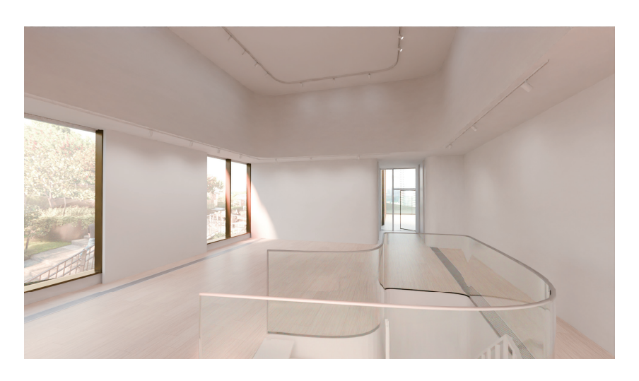
Image of Pace Tokyo © DBOX for Mori Building Co., Ltd - Azabudai Hills

Pace is an international leading art gallery, home to the estates of today's most influential contemporary artists and leading writers of the 20th and 21st centuries. Since our establishment in 1960, we have been active in a wide range of areas, with offices in seven cities around the world, including our home base in New York, as well as in Asia such as Tokyo, Hong Kong, and Seoul. Located in Azabudai Hills, our first base in Japan, the gallery will introduce artists active around the world to the Japanese public through unique and art-historical exhibitions.