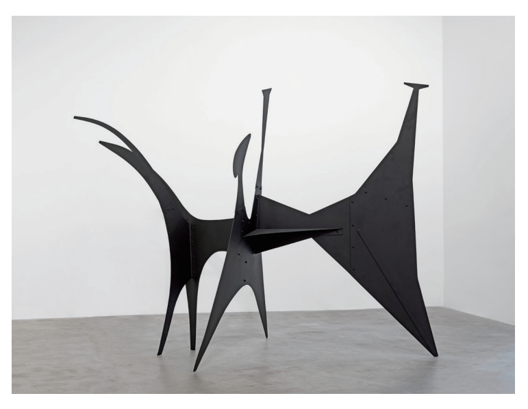
Black Beast, 1940 Sheet metal, bolts, and paint 261.6 × 414 × 199.4 cm.