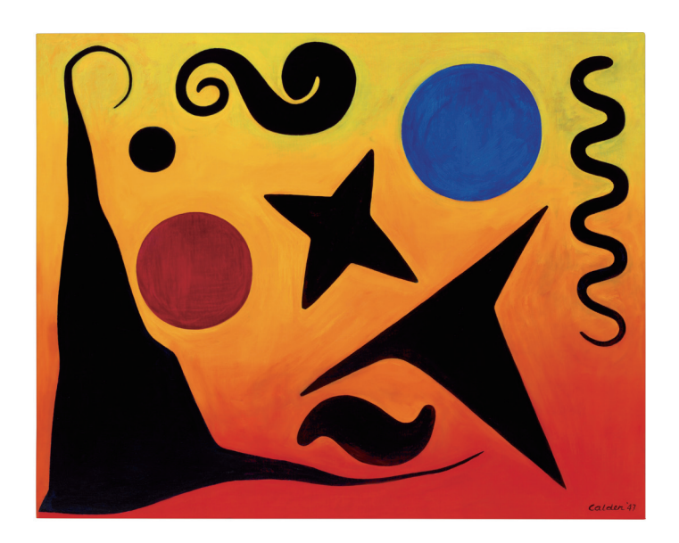
Seven Black, Red and Blue, 1947 Oil on canvas 122.2 × 153 cm.