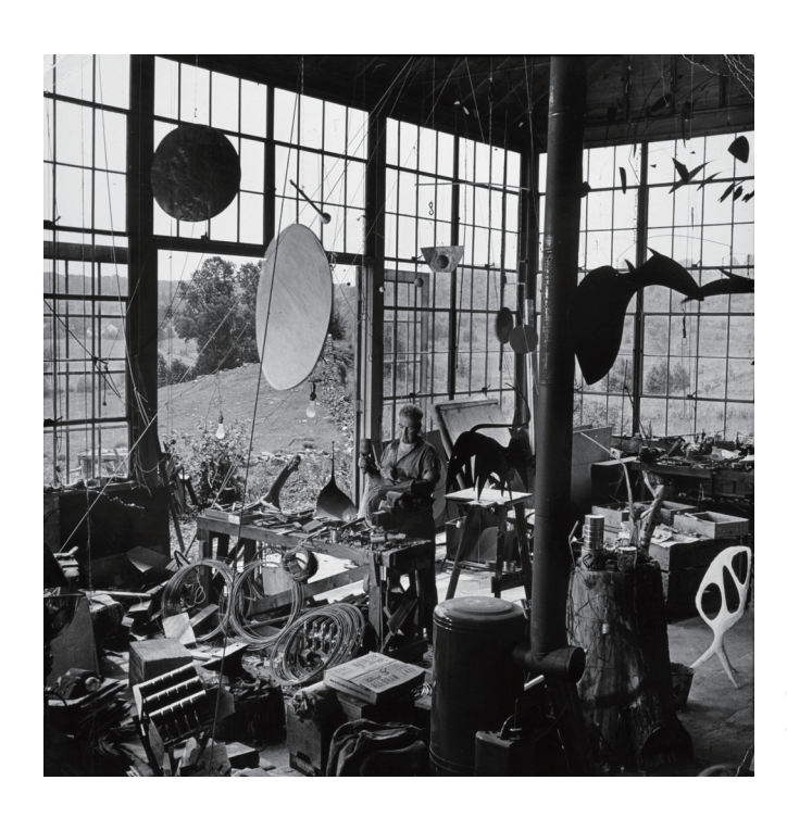
Calder with Red Disc and Gong (1940) and Untitled (c. 1940) in his Roxbury studio, 1944.