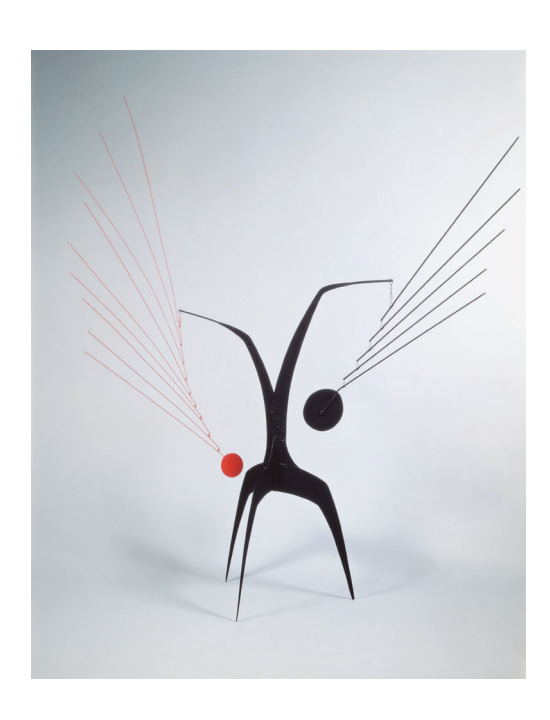
Un effet du japonais , 1941 Sheet metal, wire, rod, and paint 203.2 x 203.2 x 121.9 cm.

Calder created his iconic large-scale stabile Black Beast (1940) to barely fit inside Pierre Matisse's gallery in Midtown Manhattan, where he had a solo exhibition the same year that he made the sculpture. Nearly 14-feet wide and nine-feet tall, the work is a precursor for the artist's monumental outdoor sculptures of the 1960s and 1970s that grace city plazas around the world.